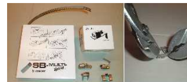
(*AX) The buckles are designed to fit V-RING type A, however can easily be adjusted to fit the V-RING type AX profile by increasing the width with a pair of pliers or similar.