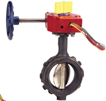
WD-3510-8** Wafer (4" Shown)

**-8 version has two factory mounted internal supervisory switches. -4 version has no switches.