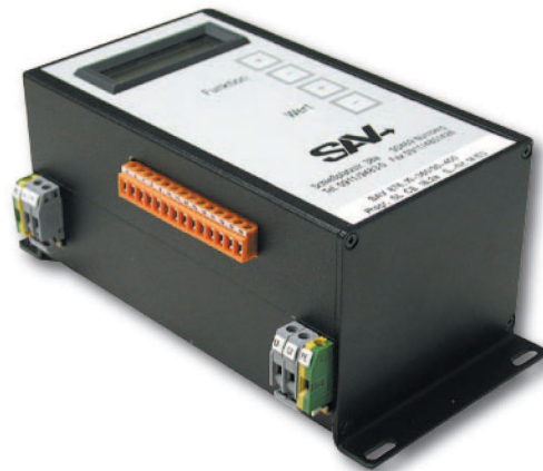
Build-in version E

When using the lowest holding force settings, the safety according VBG 7 n6 can no longer be guaranteed.